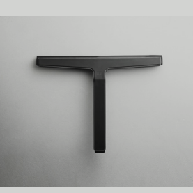
SHOWER WIPER 243 (W) x 187 (H) mm