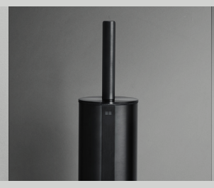
TOILET BRUSH FLOOR 422 (H) x 89 (Ø) mm

TOILET BRUSH WALL MOUNTED 416 (H) x 89 (Ø) mm