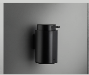
SOAP DISPENSER 133 (H) x 70 (Ø) mm x 97 (W) mm

SOAP DISPENSER WALL MOUNTED 133 (H) x 70 (Ø) mm x 114 (W) mm