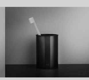
TOOTH BRUSH HOLDER 112 (H) x 76 (Ø) mm

SOAP SHELF & SHOWER WIPER soap shelf 350 (L) x 85 (W) mm wiper 243 (L) x 187 (W) mm