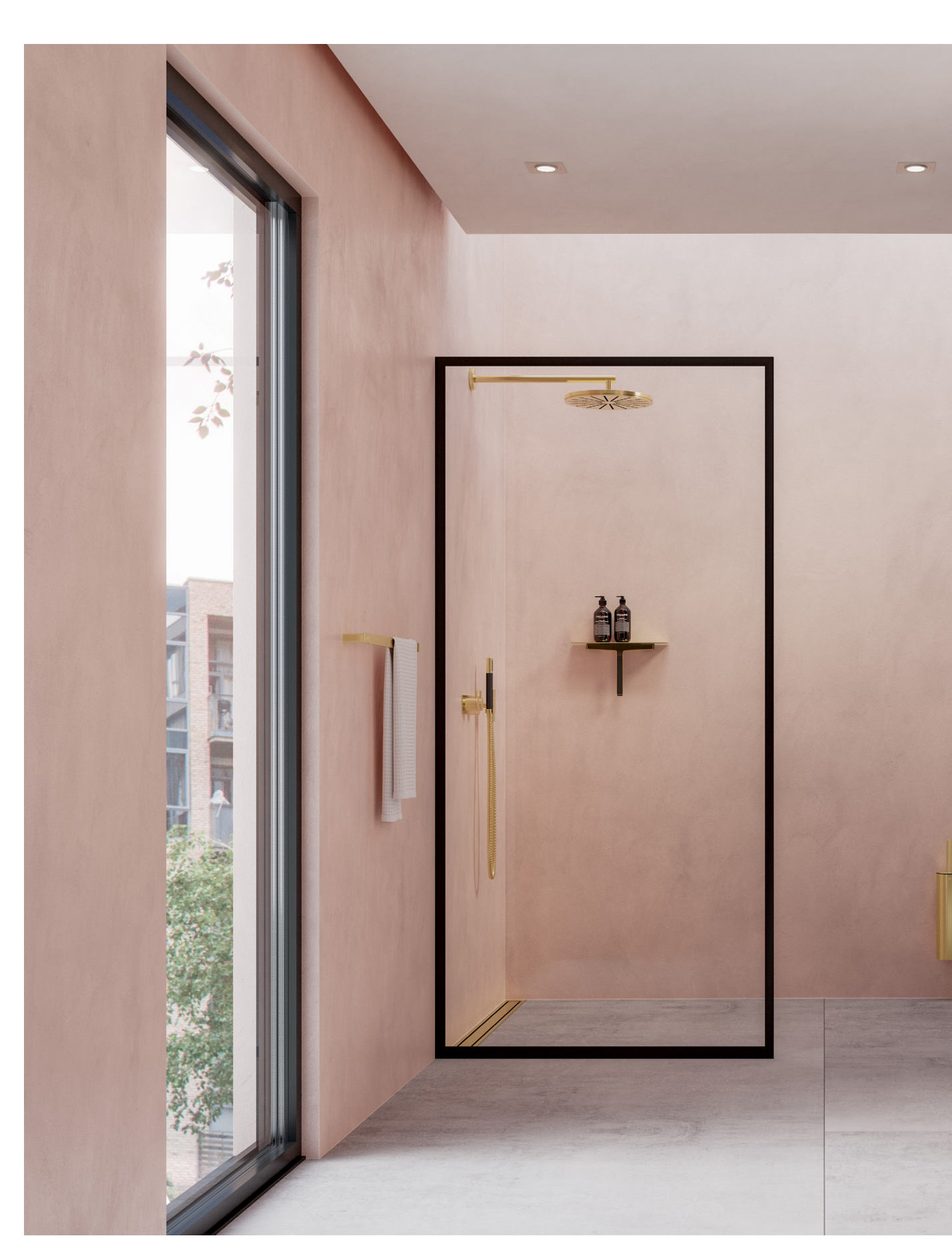
GlassLine shower screen | with black frame, HighLine floor drain | brass Reframe collection soap shelf with shower wiper, towel bar, hook, toilet brush, toilet paper holder and spare toilet paper holder | brass