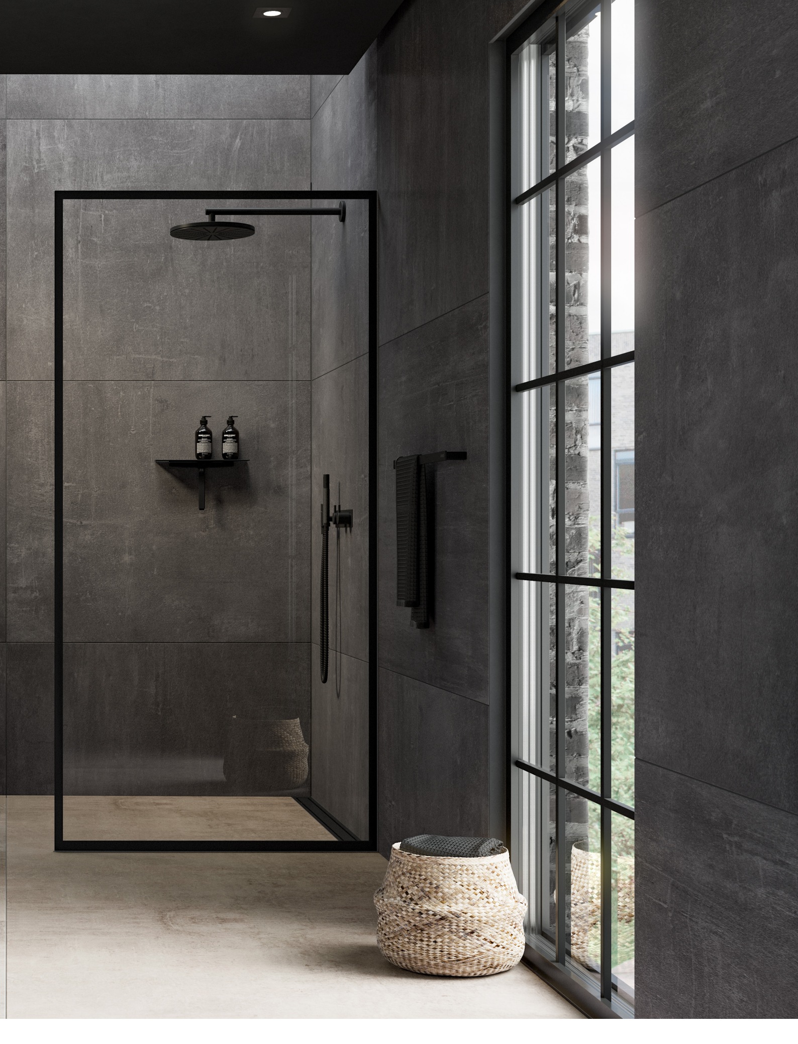
GlassLine shower screen | with black frame HighLine floor drain | black Reframe collection soap shelf with shower wiper, towel bar, hook, toilet brush, toilet paper holder and spare toilet paper holder | black