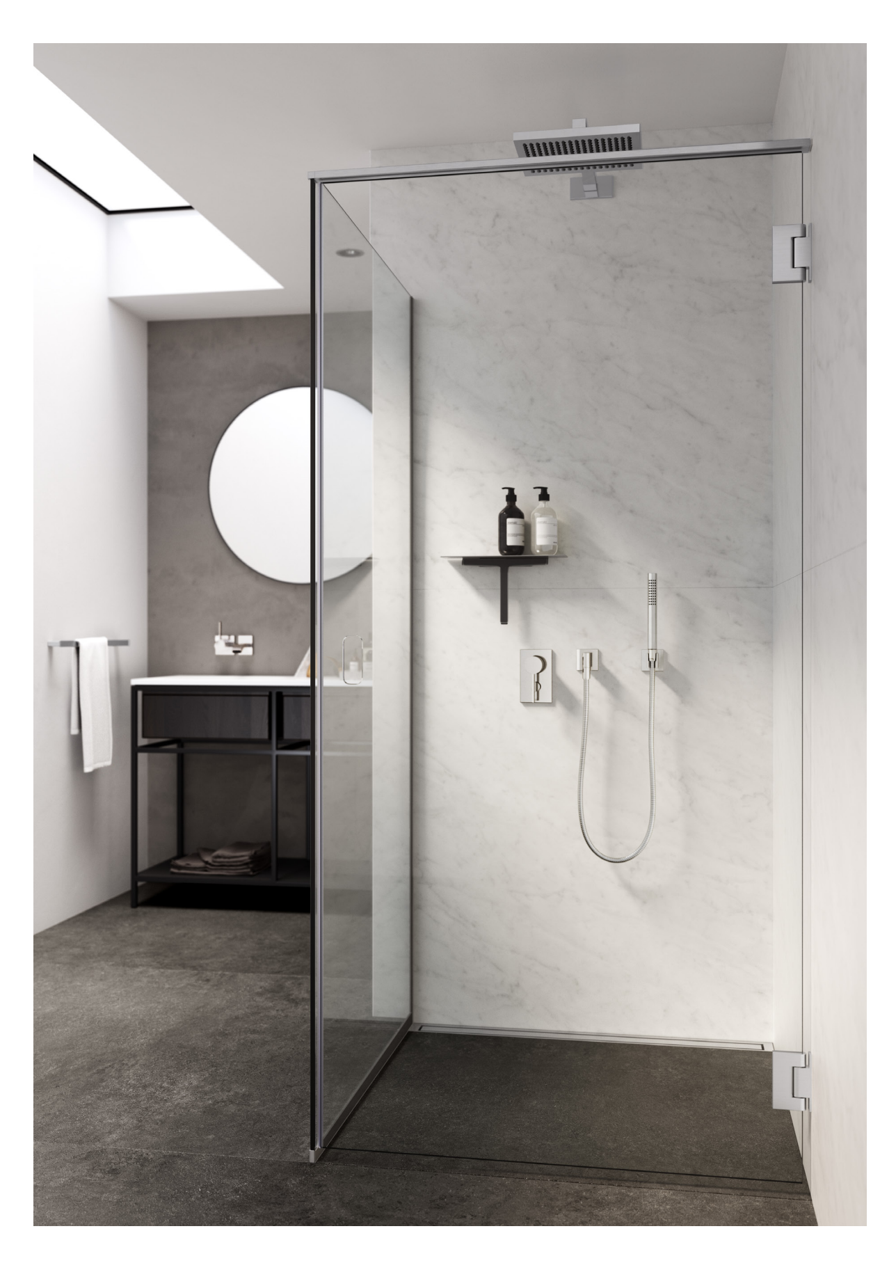
GlassLine Shower door, top rail | steel HighLine floor drain | Panel with frame